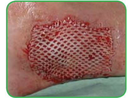
Fixation of meshed grafts using Mepitel.