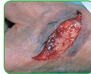
Fixation and protection of skin tear.