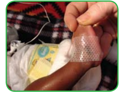
IV Extravasation and Infiltration