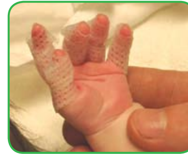
Mepitel used on a second degree burn.