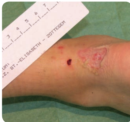
Figure 5. Case report 2: a traumatic burn wound in an awkward position above the heel at first dressing change. The position of the wound made it very painful for the patient to walk.

A 13-year-old male patient presented with a three-day-old traumatic burn wound to the lower right leg above the heel caused by contact with a hot motorcycle engine. The boy was active and the position of the wound on the heel where movement occurred made retention of the dressing difficult (Figure 5). At presentation, the wound was very painful both before and during dressing changes (VAS score 6). However, the pain severity dropped significantly when Mepilex Border Lite was introduced (VAS scores of 3 and 2 for before and