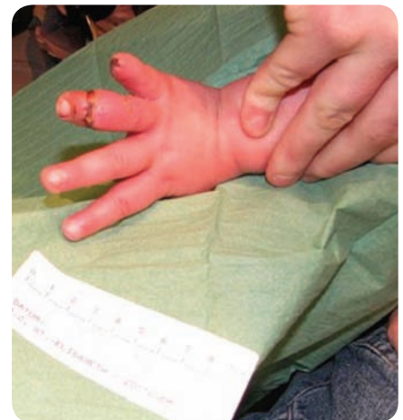
Figure 7. Case report 3: traumatic digit injuries (one resulting from amputation) at first dressing change.

A one-year-old male patient presented with a traumatic injury which resulted in amputation of the fifth digit and a damaged fourth digit on his right hand. The wound was four days old at presentation to the clinic. It was very painful before dressing change (VAS score 5) and during dressing removal (VAS score 7). The size and location of the wound, plus the disposition of the very young patient who was anxious during the procedure, made it difficult to change and re-dress the wound