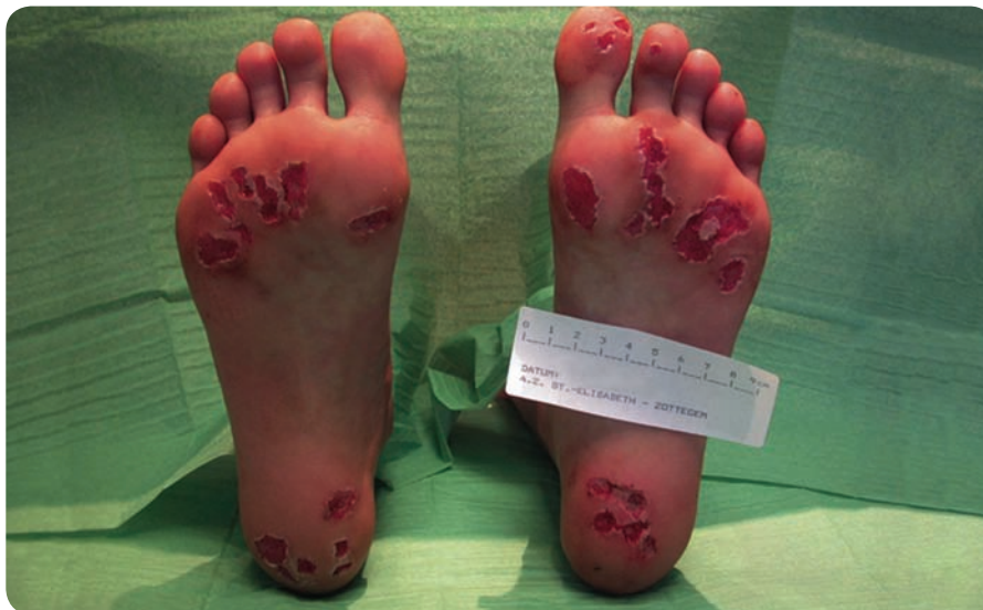
Figure 9. Case study 4: post-surgical wounds on the plantar surfaces of the feet, at first dressing change.