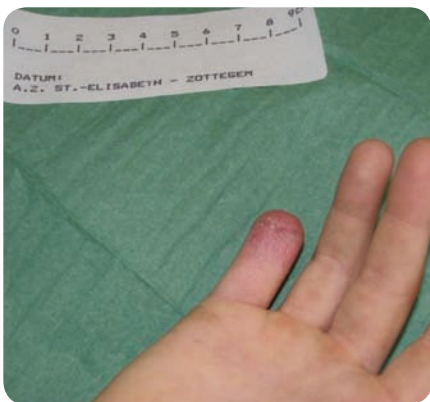
Figure 4. Case report 1: at final dressing change after 25 days of treatment. The wound had completely healed, without complications.

dropped to 1 by the fourth week of treatment when the wound had completely healed (Figure 4). Both the patient and his parents were satisfied with the performance of the dressing and rated it highly (8 on a scale of 1–10).