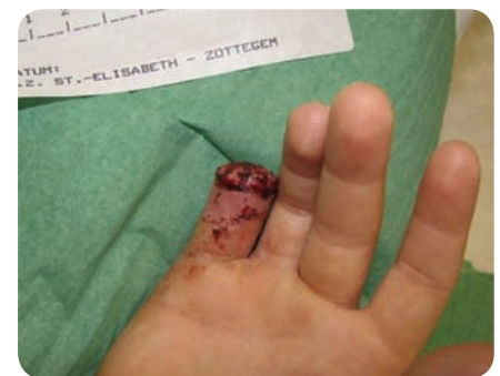
Figure 2. Case report 1: a traumatic wound to fifth digit (post-amputation) at first dressing change, illustrating the clinical challenge relating to the awkward location and small size of the wound.

A 10-year-old male patient with no underlying diseases or concerns about his medical history presented with a necrotising, traumatic injury to the tip of the fifth digit on his right hand. He subsequently had an amputation. The resulting wound had proved difficult to dress with conventional dressings due to its small size and location. At the beginning of the study, the wound was three days old and in good condition (90% viable tissue present) (Figure 2). Nevertheless, the patient experienced significant pain both before dressing change (VAS score 5 on a scale of 0–10) and at dressing removal (VAS score 6). After introducing Mepilex Border Lite (Figure 3), both VAS scores dropped immediately to 3 and had