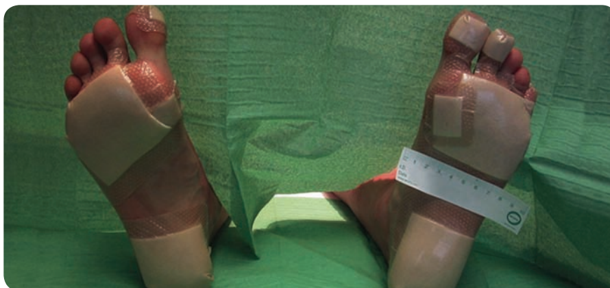
Figure 10. Case report 4: Mepilex Border Lite dressings in situ enabled patient to return to full mobility and complete wound healing.

experiencing significant discomfort on walking as a result of these wounds. Mepilex Border Lite was applied to the soles of the feet (Figure 10), resulting in rapid resolution of discomfort, a return to full mobility and complete healing. The dressing conformed well to the surfaces of the feet and remained securely in place between dressing changes.