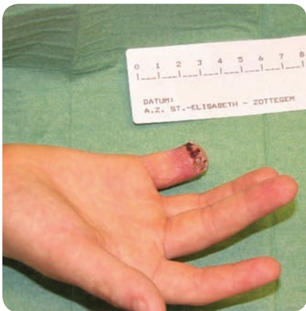
Figure 3. Case report 1: at third dressing change, seven days later. Good healing progression and significantly reduced inflammation can be observed.