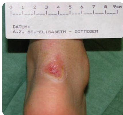
Figure 6. Case report 2: at eighth dressing change. Good re-epithelialisation with minimal inflammation observed. Wound progressed to complete healing.

during dressing changes, respectively). Within a few days, the wound was being treated at home and the patient was able to wear shoes comfortably and resume normal activities. The wound healed completely with about three weeks of treatment with Mepilex Border Lite (Figure 6).