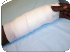
Application with roll gauze