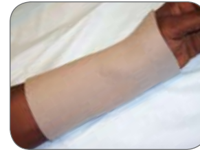
Day 4 reapplication