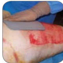
Application of Mepilex Ag