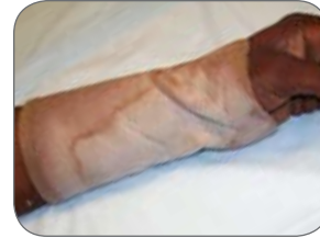
Day 11 prior to removal