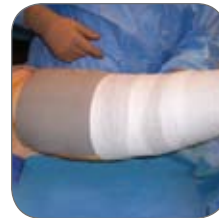
Application of secondary dressing